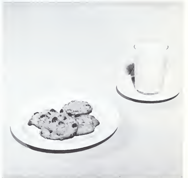
N-39864--Milk and oatmeal cookies make a nutritious and inviting snack.